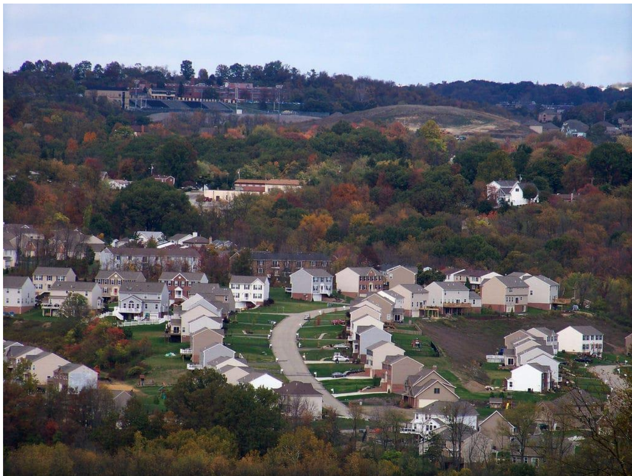
"Suburbia," photographed by Jon Dawson, October 15, 2010, CC BY-ND 2.0 .