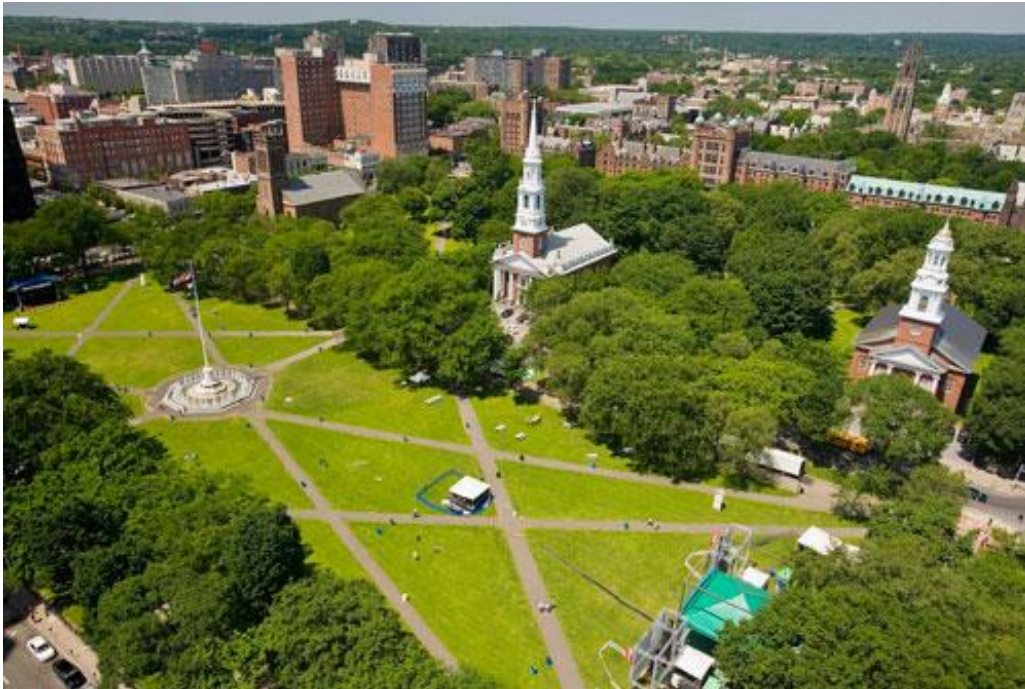
New Haven Green: New Haven, Connecticut